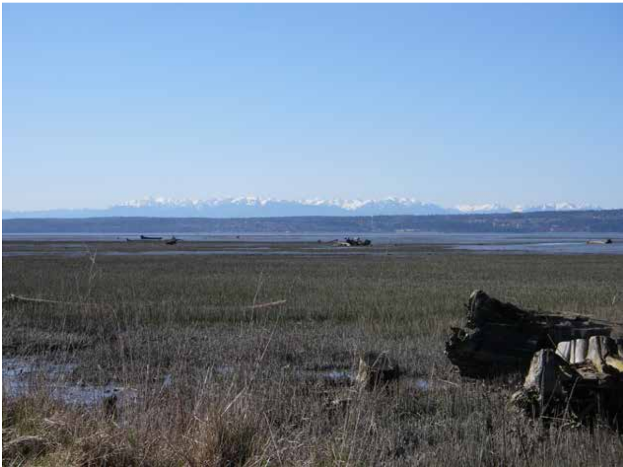
The Nature Conservancy Port Susan Bay Preserve, Port Susan, WA

Prepared by: Snohomish County Marine Resources Advisory Committee & Staff October 2011